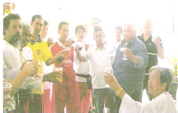
A toast for a longer, healthier life.

As part of this Executive Order, the seal of the World Sikaran Brotherhood and the term Baras, Home of Sikaran was adopted as an official part of the Municipal Letterhead. As far as it is known, the Municipality of Baras is the only official government agency anywhere in the world that honors the birthplace of a martial art and publicly displaying it on its letterhead. The Municipal Board has likewise designated the last Sunday of March as Sikaran Festival Day and has earmarked the logistical appropriation for the event. Presently underway is placing a monument of bronze of two Sikaran fighters exchanging biyakids in front of the Municipal Hall. The existing monument will be moved next to the main entrance to the gymnasium. Two new bronze boundary markers welcoming people to Baras with the words "Welcome to Baras, Home of Sikaran" are also being worked on to replace the old one erected more than 20 years ago. One marker will be facing Morong and the other facing Tanay. Funds are also being appropriated to pave the mountain road leading to the Sikaran Training Camp up in the mountain bordering Antipolo where the BBC series Last Man Standing was filmed.